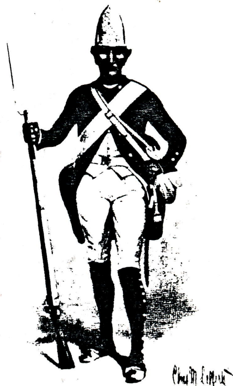
FUSILEER REGIMENT ERB PRINZ OF HESSE-CASSEL, 1776 PRIVATE

At this point I realized that that old genealogical maxim about working back one step at a time was really going to have to apply after all. There is no shortcut. Before it could be decided