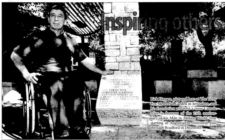
Rick Hansen pictured here at the Terry Fox Memorial Garden in Jerusalem, and his foundation will host a cross Canada relay in honour of the 25th anniversary of his Man in Motion World Tour starting in August. The relay will pass through Bradford in December.